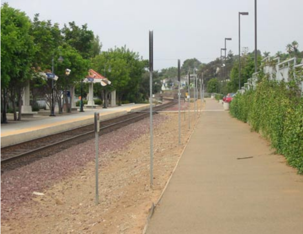
Above: Sidewalk in close proximity to trains at Encinitas station.

Setback distance must be determined on a case-by-case basis, as there is too much variation in field conditions and too few existing RWTs to offer a standard at this time.